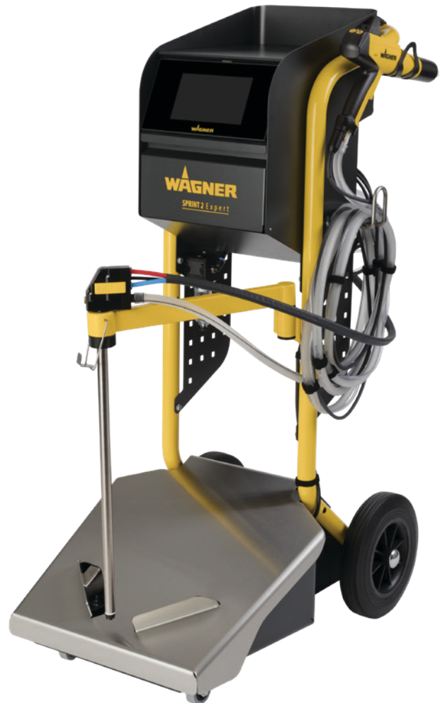
Sprint 2 Expert